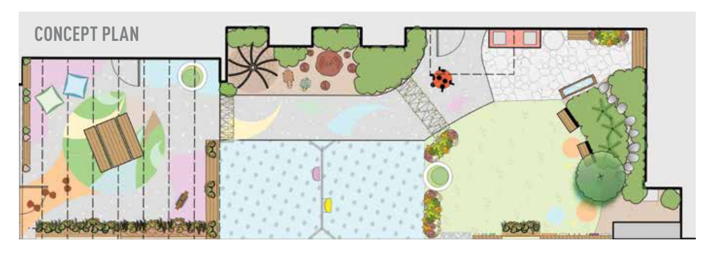
An artist's impression of the new outdoor space for Wantirna South Flexible Respite Service.

To donate please call 1800 036 377 or visit www.vmch.com.au/donate-now/